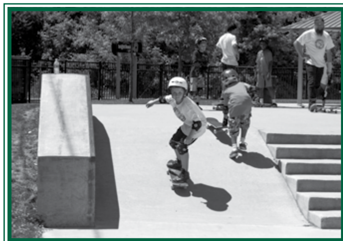
Have fun at Riley Skate Park!

ART ON THE GRAND – June 3, 10 a.m. – 7 p.m.; June 4, 11 a.m. – 5 p.m. FREE juried fine art fair. Variety of artists, disciplines, and price ranges offering painting, pottery, photography, jewelry, mixed media, wood, wearable art, glass, leather, and sculpture. Hands-on kids' area with participation from the DIA. New "Kids' Art Alley" with young local artists selling their creations, plus a community mural and a hands-on upcycled arts and crafts area. Go to www.artonthegrand.com .