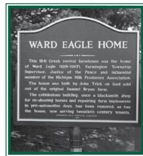
Ward Eagle House historic marker, HD #310, 29655 Fourteen Mile Road

Whether walking, biking or driving, you may have noticed the green historical markers located at historic district sites throughout the city. When you see one, please stop to check it out and learn a bit about the history of your community. There are currently markers located at 32 out of 74 designated historic districts and at nine other historic sites in the City, which are installed and maintained by the Historic District Commission and the Historical Commission. If you are the owner of a historic district and are interested in having a sign installed at your building or site, please contact the Planning Office at 248-871-2540 for information on the process. A map showing the locations of all the historic markers, districts, and sites is available on the City website at http://www.fhgov.com/Government/Boards-Commissions/Historic-District-Commission.aspx .